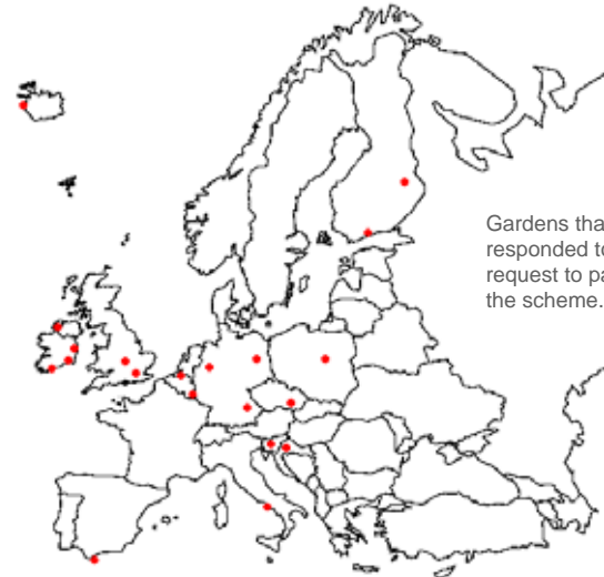
Gardens that have responded to the first request to participate in the scheme.

Since no central organisation, compilation or databasing is required, there are no costs or administration overheads other than voluntary co-operation by participating seed-list managers over the coming years in adding the code word to their on-line seed lists.